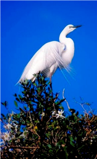
Kotuku Okarito Lagoon